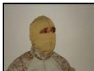
1 ea. light weight 1 ea. mid weight