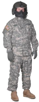
Army Aviation Combat Uniform (A2CU)

A multi-layered, versatile, insulating system for combat vehicle crews and aviation crews that is adaptable to varying operational and environmental conditions.